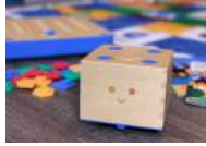
Table top Games March 12 2 PM